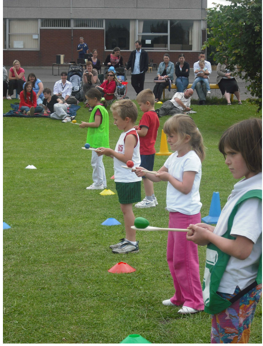
Egg & Spoon Race Reporter: Kyle Crosby