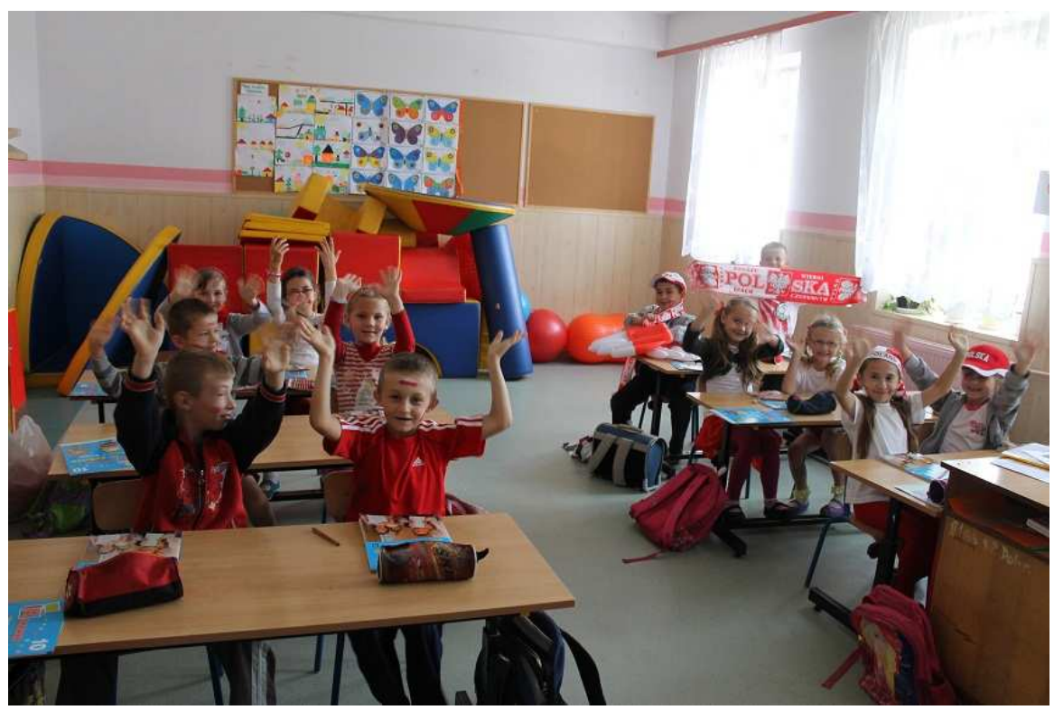
3. Football Fan Day